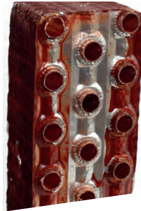
WITHOUT BLYGOLD POLUAL XT